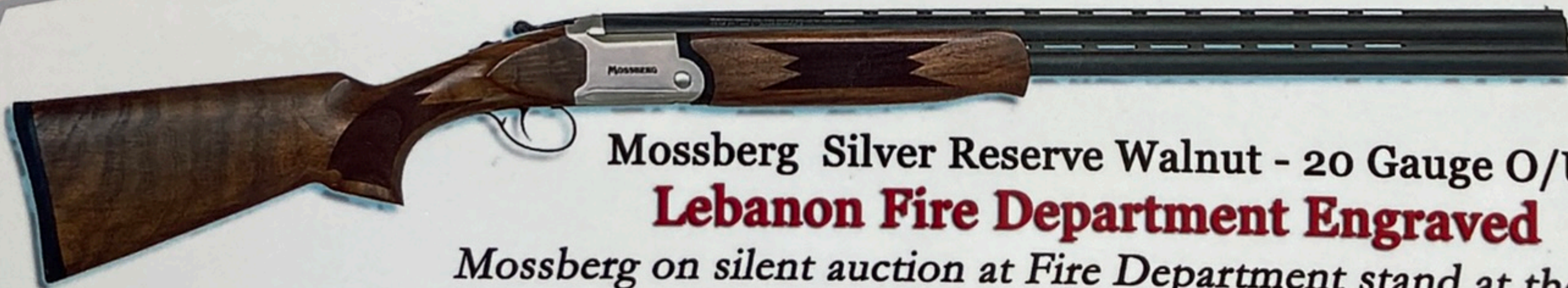
Mossberg Silver Reserve Walnut - 20 Gauge O/U Lebanon Fire Department Engraved

Mossberg on silent auction at Fire Department stand at the Bash