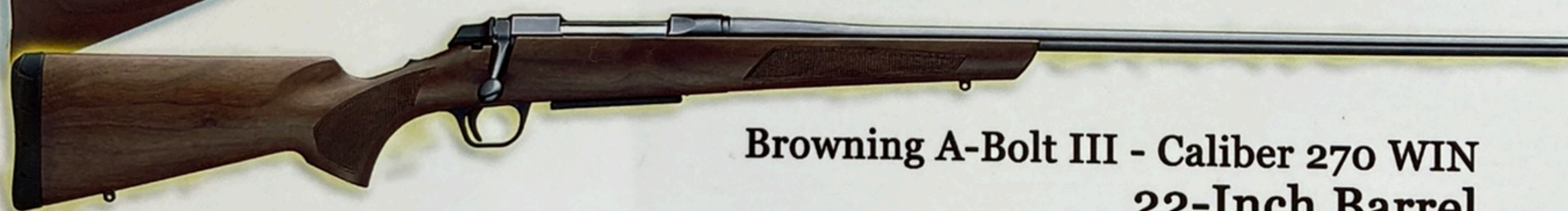
Browning A-Bolt III - Caliber 270 WIN 22-Inch Barrel